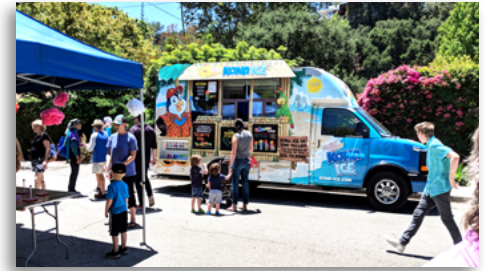
The Kona Ice truck