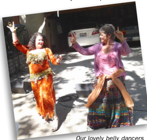
Our lovely belly dancers