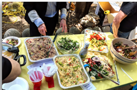
Part of the vast array of delicious food